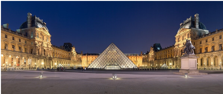
MUSEE DU LOUVRES