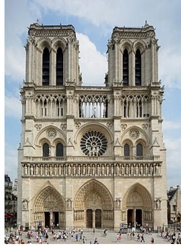
NOTRE DAME DE PARIS